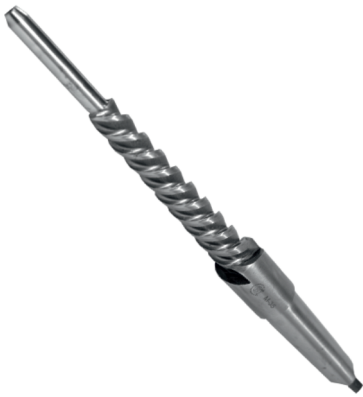
Taper Core Drill