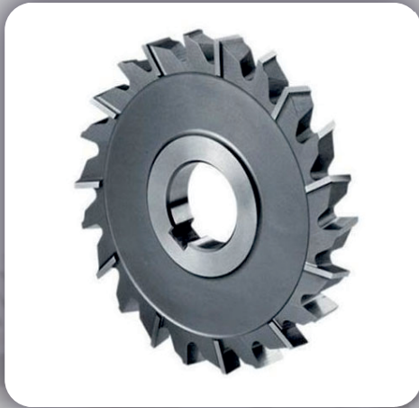
Side & Face Cutters (Staggered Teeth)