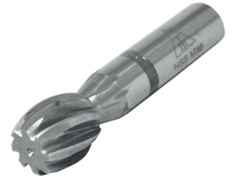
Radius Shank Cutter