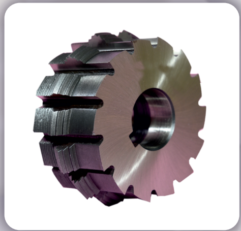
Pliers Teeth Cutter