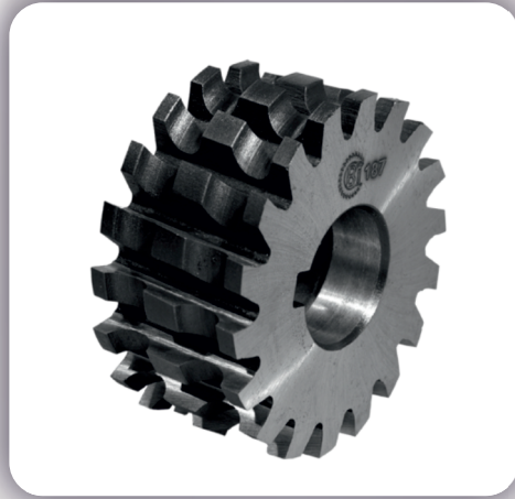
Double Radius Cutter