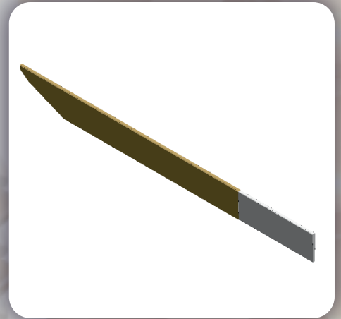
Slotting Tool Bit