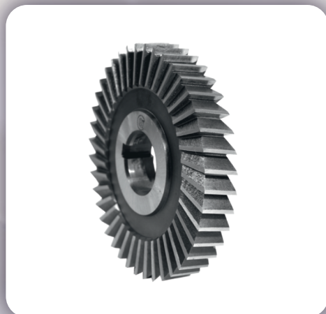
Side & Face Cutter