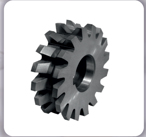
Plier Lap Cutter