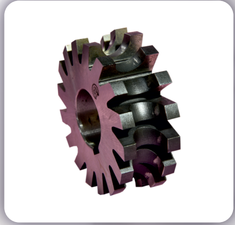
Radius Concave Cutter