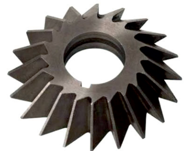
Single Angle Cutter