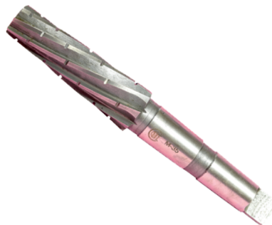
Machine Taper Reamer