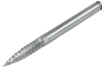
Radius Nose Pin