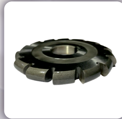
Convex Radius Cutter