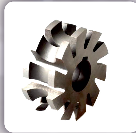
Concave Cutter Half Radius