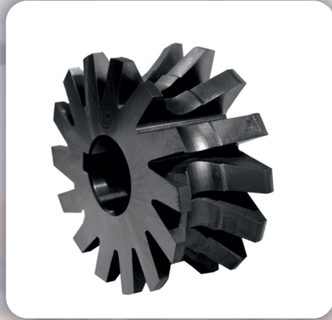
Kick Profile Cutter