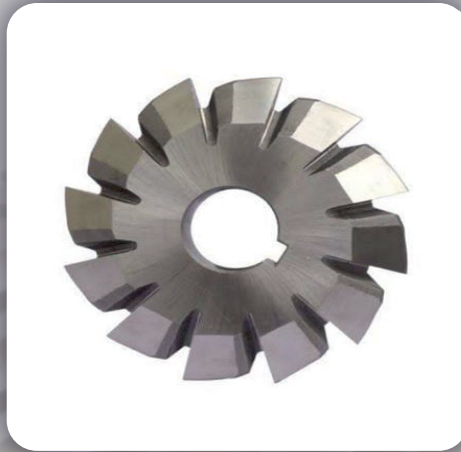
Involute Gear Cutter