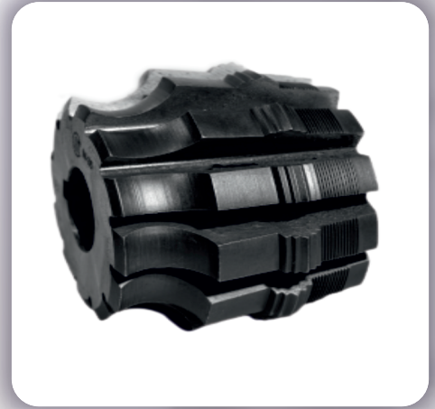
Plier Profile Cutter